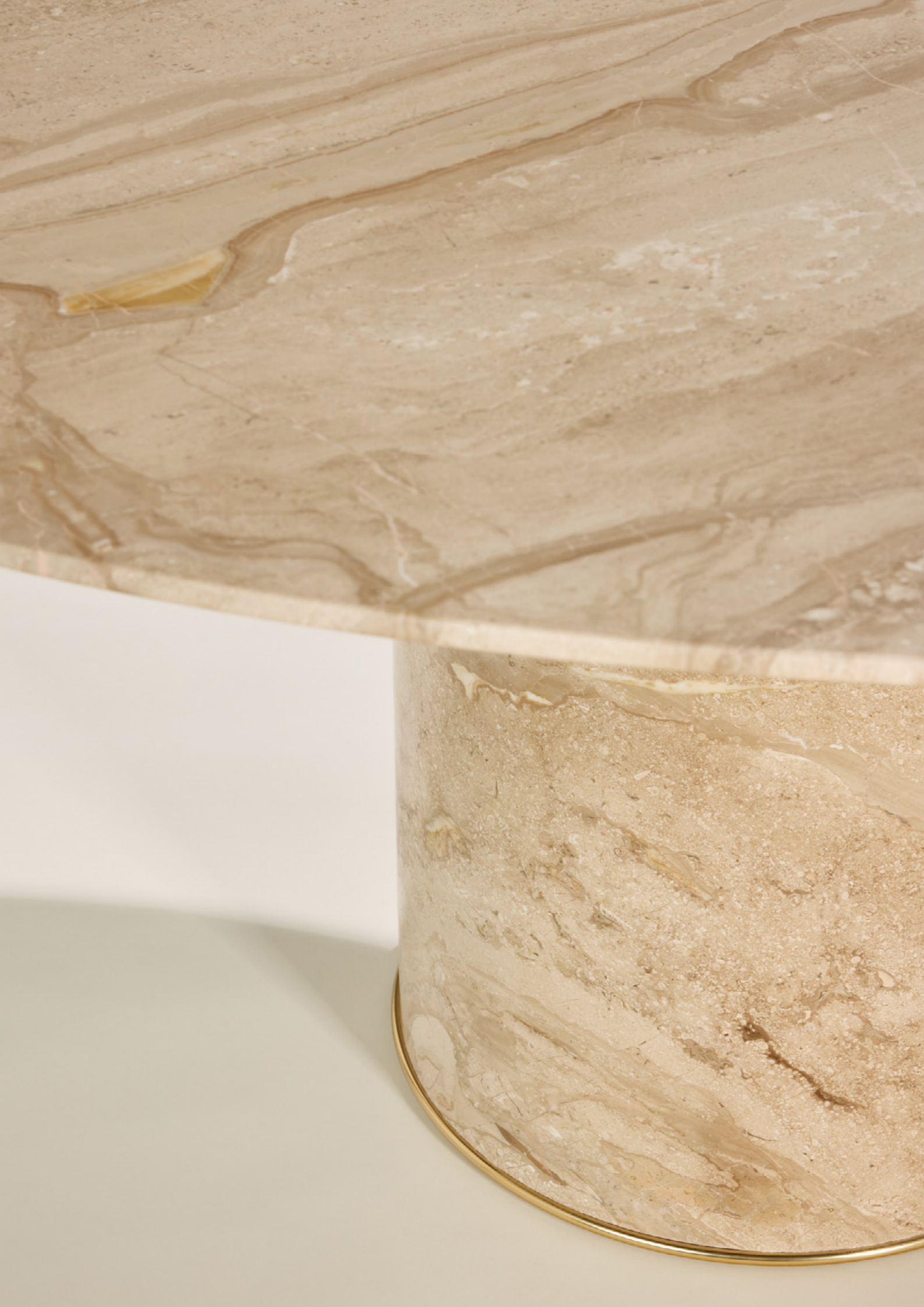
> Arcis Dining Table