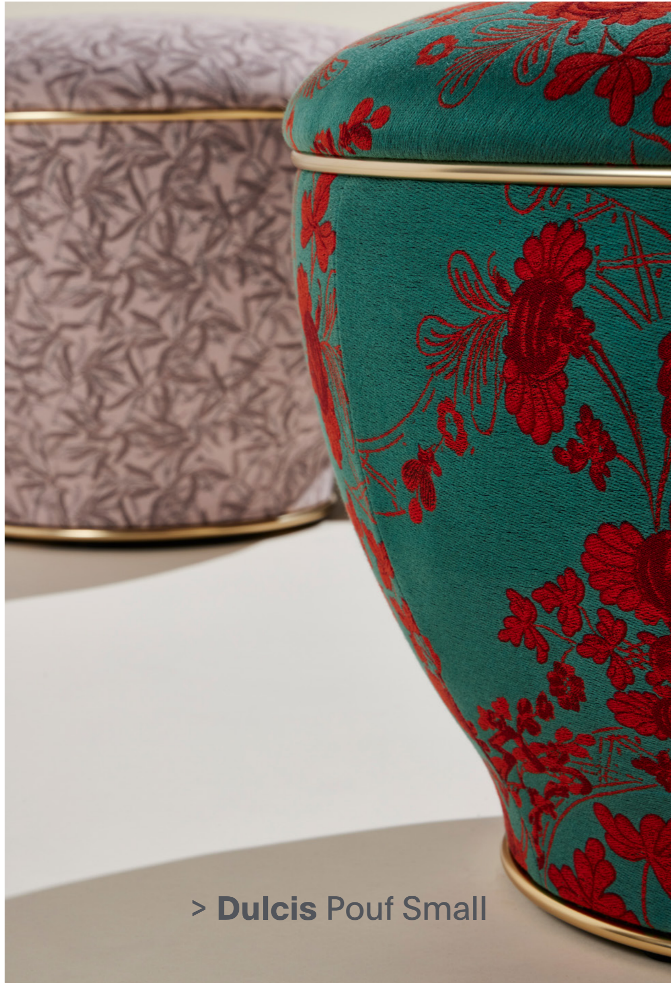
> Dulcis Pouf Small