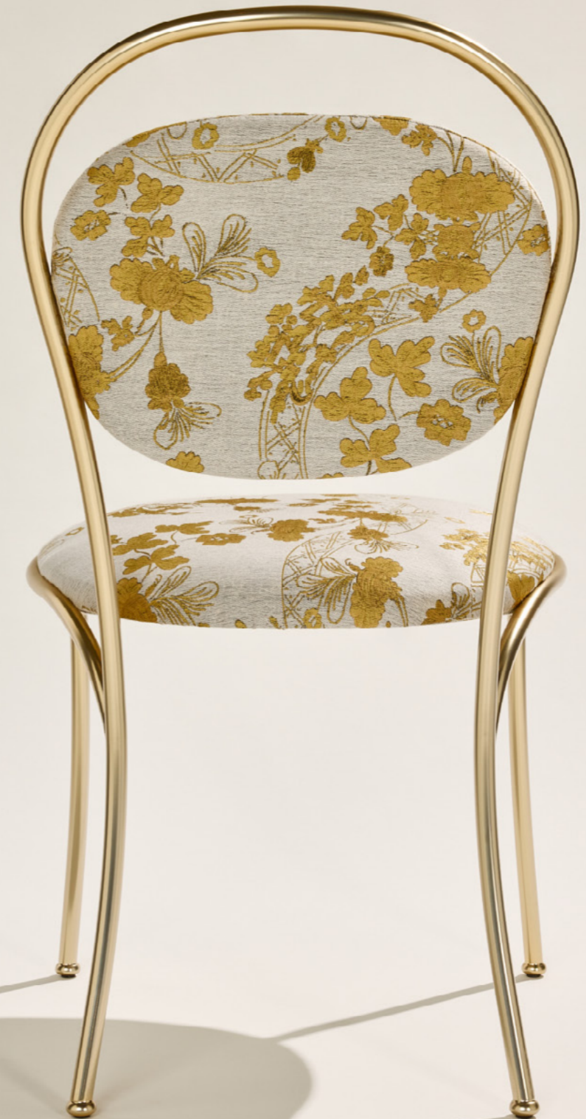
> Volina Chair