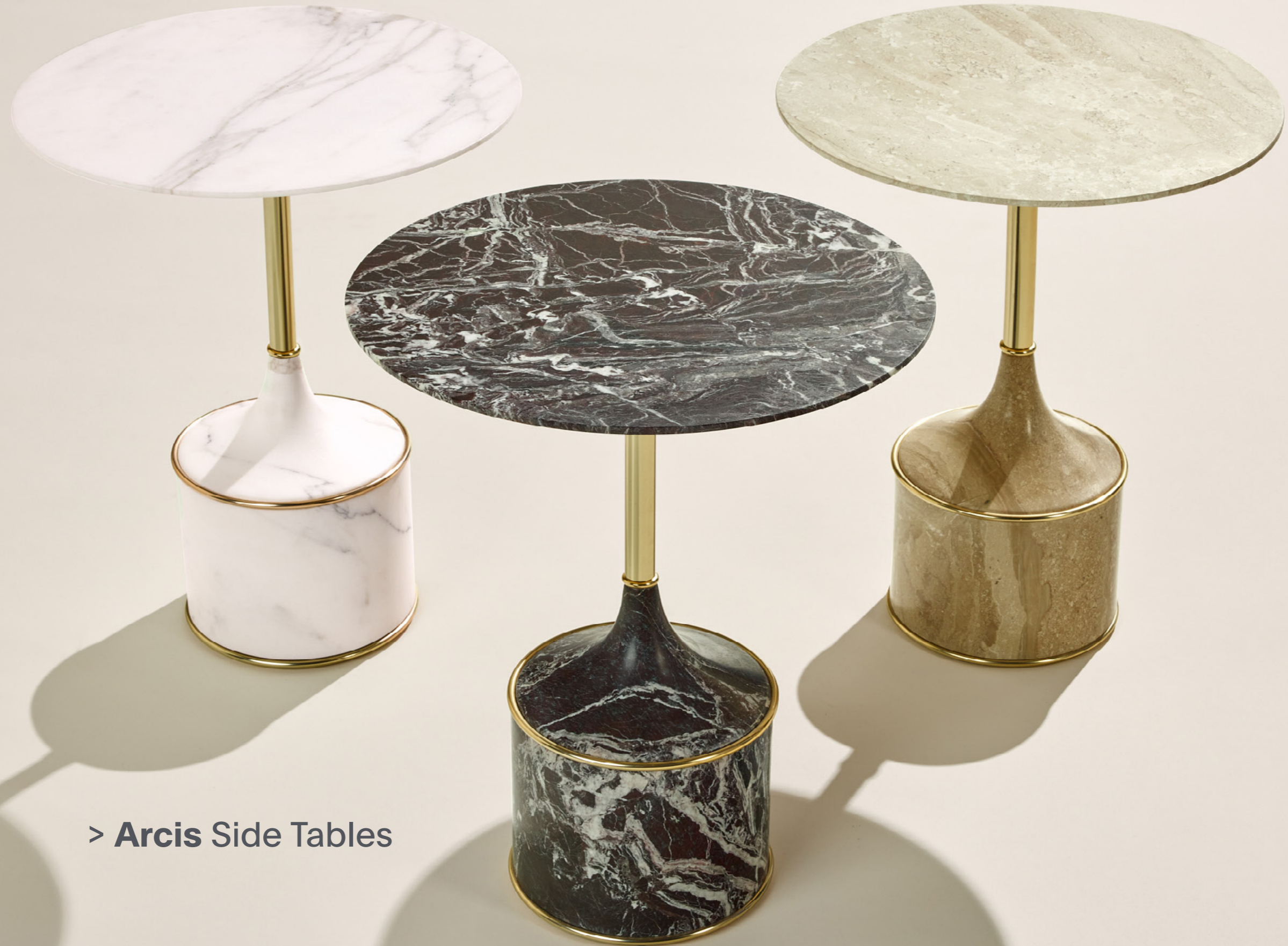
> Arcis Side Tables