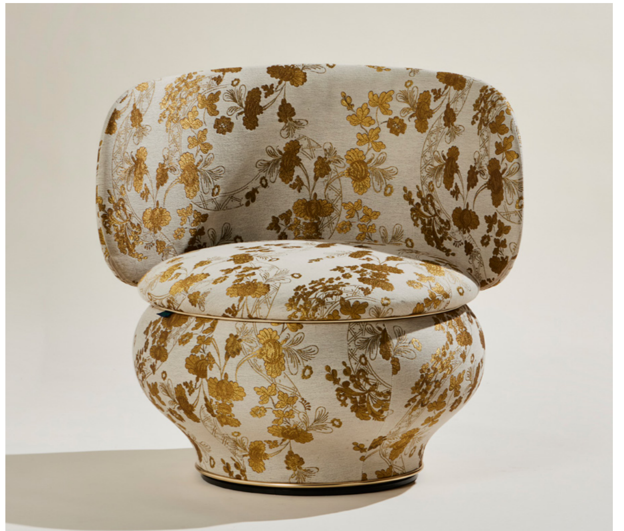
> Dulcis Pouf Swivel Chair