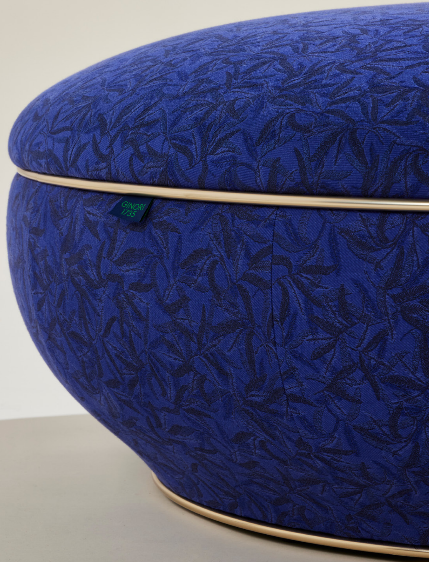
> Dulcis Pouf Large