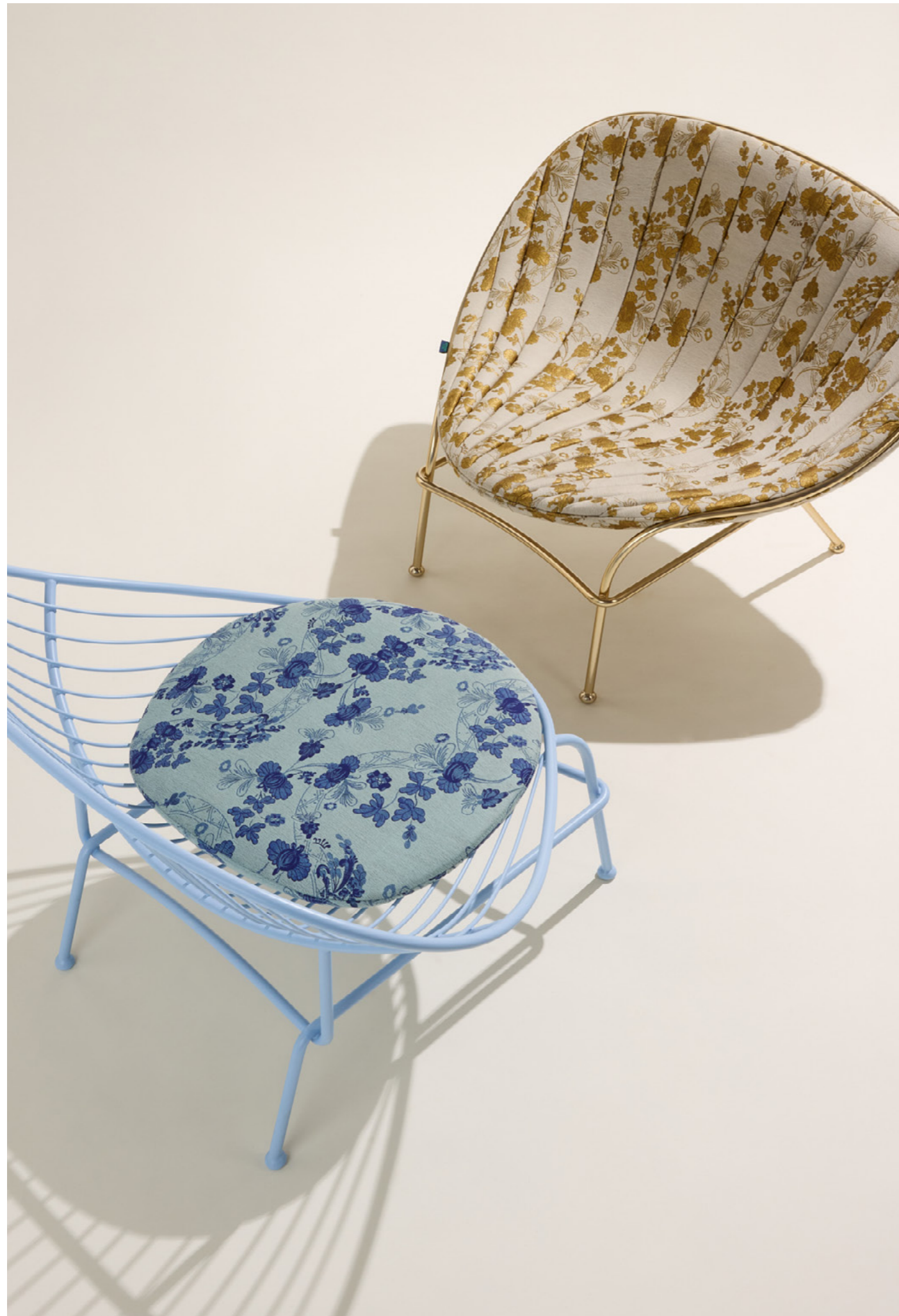
> LaVenus Wireframe Lounge Chair